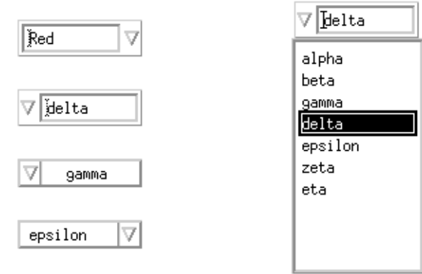
Figure 7-2 Examples of text field and list box widget (DtComboBox)

• Text field and list box widget (DtComboBox)