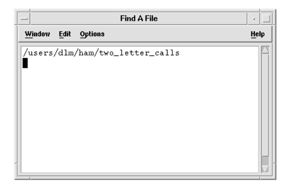
Figure 4-3 Window showing complete path

When you correct the mistake, script_find then executes properly and creates a dtterm window within which it displays the complete path of the file you requested, providing that the file is found.