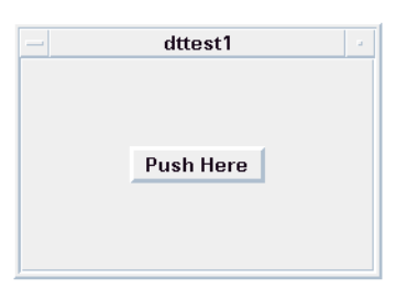
Figure 2-1 Window from script dttest